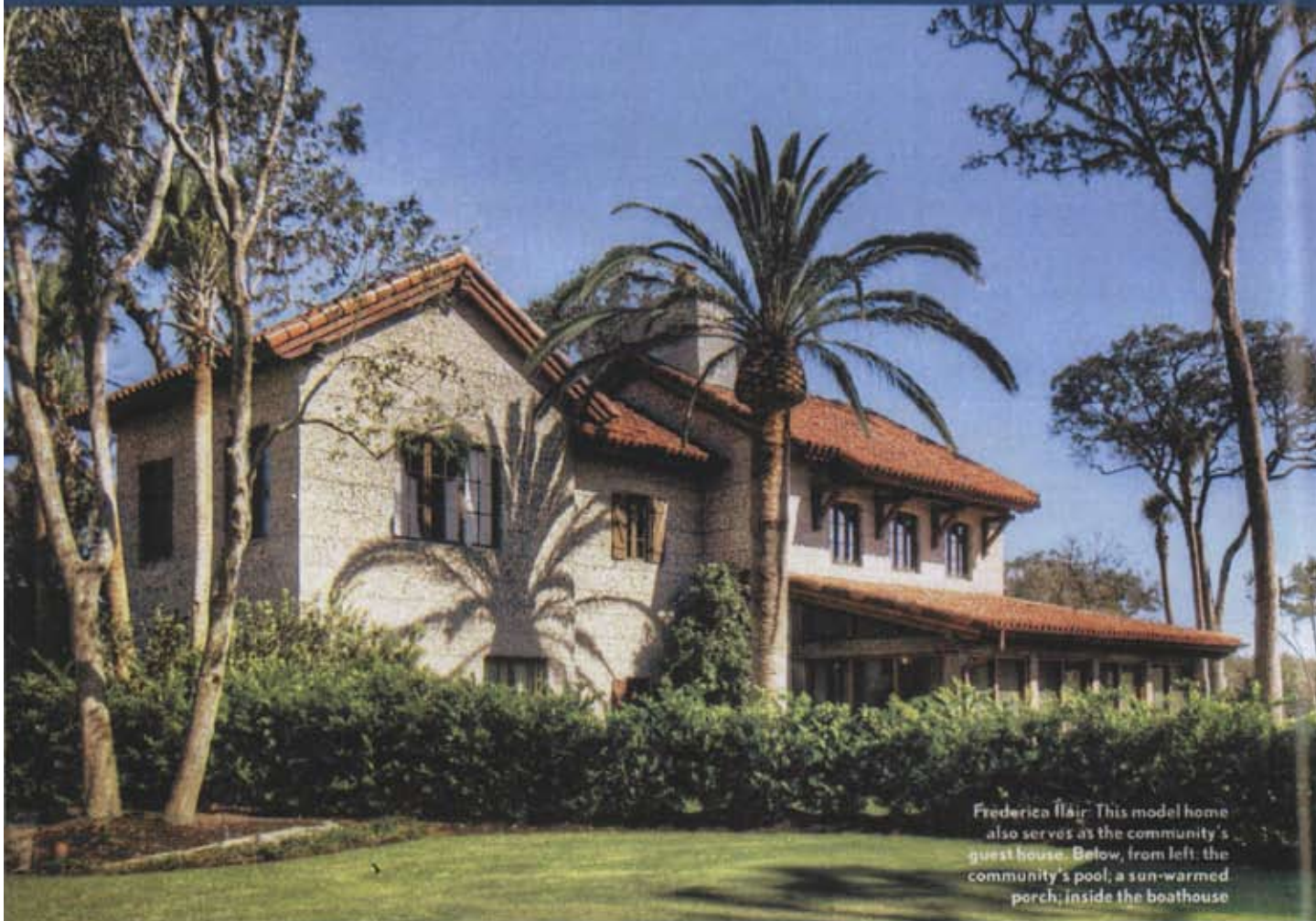
Frederica Flair —This model home also serves as the community's guest house. Below, from left: the community's pool; a sun-warmed porch; inside the boathouse