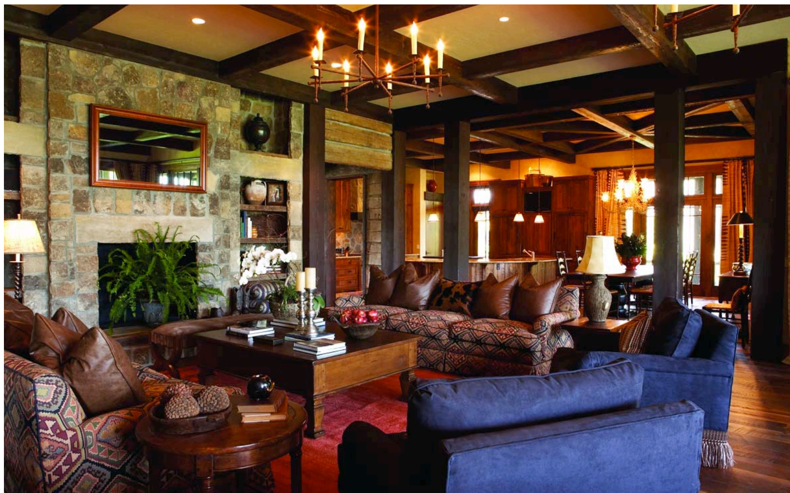
The stones, woods and well-chosen accents in the dramatic entry hall (left) create the strong Western sensibility. Large cozy furnishings (above) lend a lodge-like feel to the great room.

BRINGING WESTERN FLAIR TO THE SOUTH MEANT DECORATING IN WARM COLORS WITH JEWELLED TONES AND GEOMETRIC PATTERNS